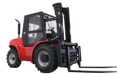
T40/50 Capacity: 4.0/5.0T Lifting Height: 3000mm Max.Lifting Height:6500mm Drive Type: 4x2