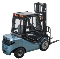
C30 Capacity: 3.0T Lifting Height: 3000mm Max.Lifting Height:6500mm