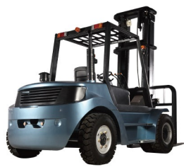
H120 Capacity: 12.0T Lifting Height: 3000mm Max.Lifting Height:6500mm