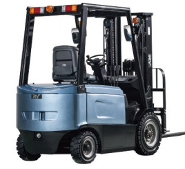
E20/25/30/35 Capacity: 2.0/2.5/3.0/3.5T Lifting Height: 3000mm Max.Lifting Height:6500mm ZAPI Full AC