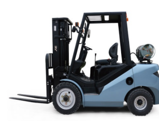
G30/35/40 Capacity: 3.0/3.5/mimi4.0 T Lifting Height: 3000mm Max.Lifting Height:6500mm