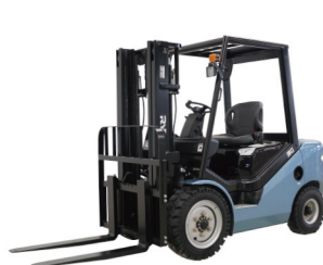
C35 Capacity: 3.5T Lifting Height: 3000mm Max.Lifting Height:6500mm