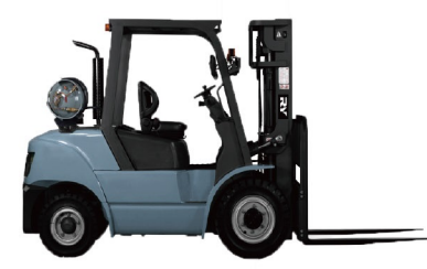
G45/50 Capacity: 4.0/mini5.0 T Lifting Height: 3000mm Max.Lifting Height:6500mm