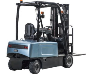
E20/25D Capacity: 2.0/2.5T Lifting Height: 3000mm Max.Lifting Height:6500mm ZAPI Full AC Dual Driven Motors