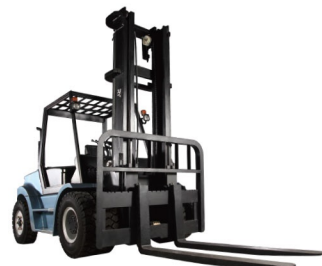
H90/100 Capacity: 9.0/10.0T Lifting Height: 3000mm Max.Lifting Height:6500mm