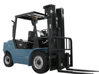
C45/50 Capacity: 4.5/mini5.0T Lifting Height: 3000mm Max.Lifting Height:6500mm