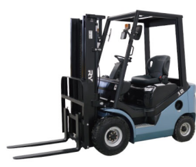
C18 Capacity: 1.8T Lifting Height: 3000mm Max.Lifting Height:6500mm