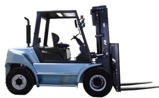
H50 Capacity: 5.0T Lifting Height: 3000mm Max.Lifting Height:6500mm