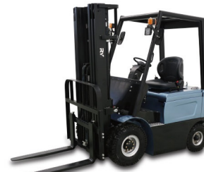
E15/18 Capacity: 1.5/1.8T Lifting Height: 3000mm Max.Lifting Height:6500mm ZAPI Full AC