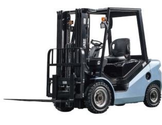
C20 Capacity: 2.0 T Lifting Height: 3000mm Max.Lifting Height:6500mm