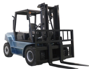
H60/70 Capacity: 6.0/7.0T Lifting Height: 3000mm Max.Lifting Height:6500mm