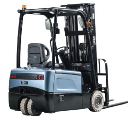
E16/18/20e Capacity: 1.6/1.8/2.0T Lifting Height: 3000mm Max.Lifting Height:6500mm ZAPI Full AC Dual Driven Motors