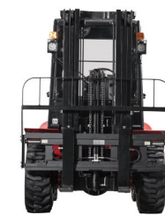
T20/25/30/35A Capacity: 2.0/2.5/3.0/3.5T Lifting Height: 3000mm Max.Lifting Height:6500mm Drive Type: 4x4