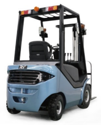
C15 Capacity: 1.5T Lifting Height: 3000mm Max.Lifting Height:6500mm