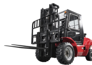
T20/25 Capacity: 2.0/2.5T Lifting Height: 3000mm Max.Lifting Height:6500mm Drive Type: 4x2