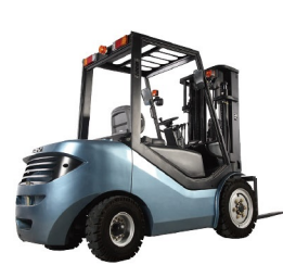
C40 Capacity: mini4.0T Lifting Height: 3000mm Max.Lifting Height:6500mm