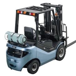
G20/25 Capacity: 2.0/2.5T Lifting Height: 3000mm Max.Lifting Height:6500mm