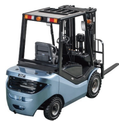
C25 Capacity: 2.5 T Lifting Height: 3000mm Max.Lifting Height:6500mm