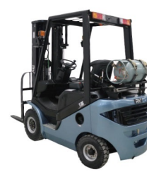
G15/18 Capacity: 1.5/1.8T Lifting Height: 3000mm Max.Lifting Height:6500mm