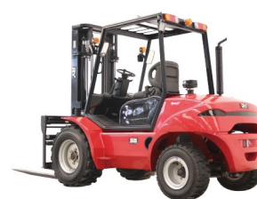
T30/35 Capacity: 3.0/3.5T Lifting Height: 3000mm Max.Lifting Height:6500mm Drive Type: 4x2